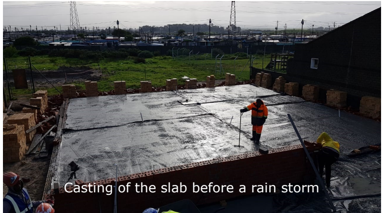
Casting of the slab before a rain storm