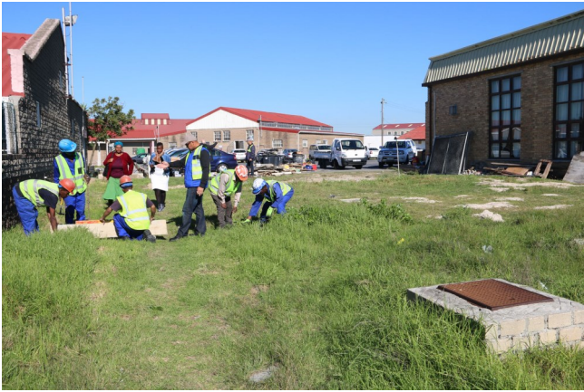
Site on 5th June

The following photos give visual progress of the refurbishment of the building construction. The rain has resulted in some delays however good progress is being made and the project is on schedule.